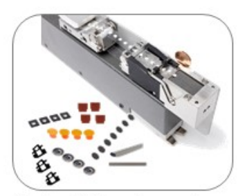
Label Feeder, also for special parts