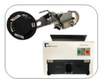
Tape Feeder and accessories