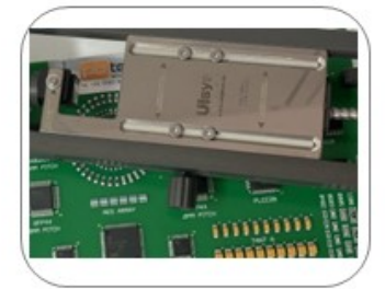
Reflow Inline Video Camera