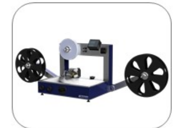
Manual Taping Systems