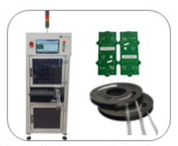
Label/ Laser Marker and labels