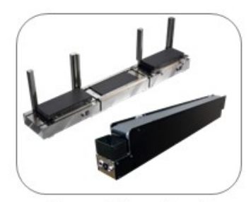
Tray Handler / Reject Parts Conveyor