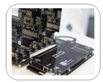
Univers. In-System Programmers