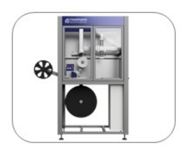
Automatic Packing Systems